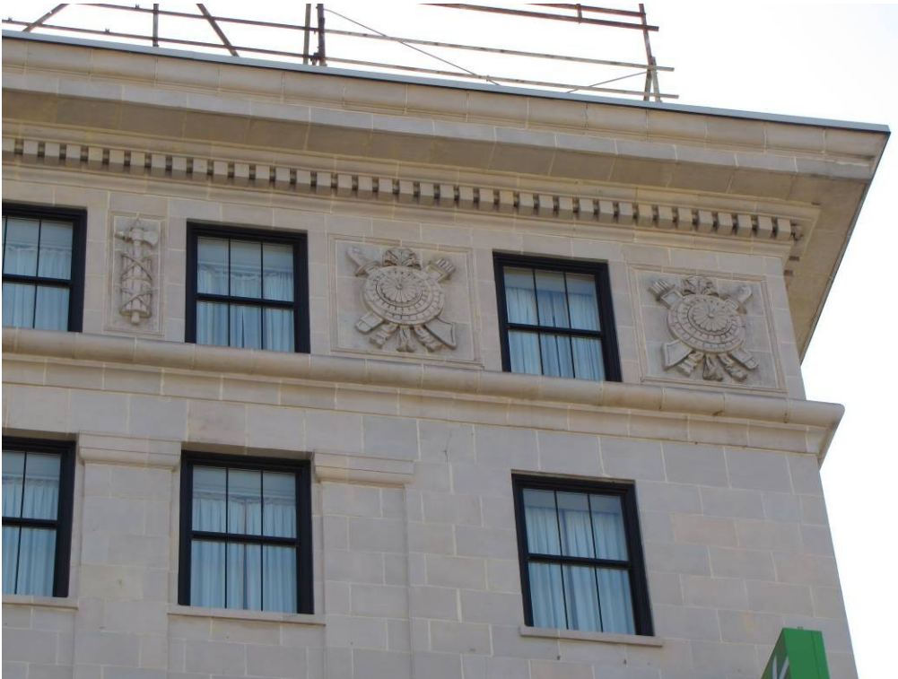
Detail of bas-reliefs on top floor and cornice.