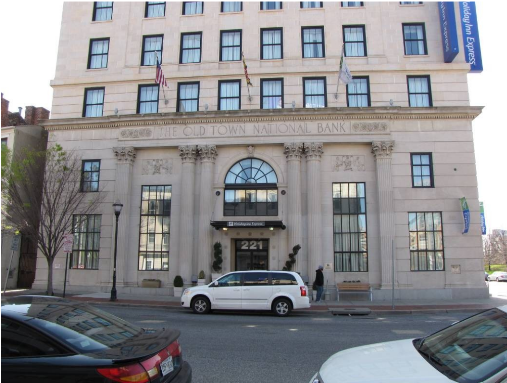
Detail of entrance on front façade, on N. Gay St.