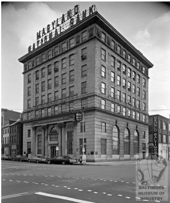
Exterior of bank in 1968.

Ad in the Baltimore Sun. "Display Ad 11 -- No Title", The Sun (1837-1986); Aug 3, 1925; ProQuest Historical Newspapers: Baltimore Sun, The (1837-1986), 4