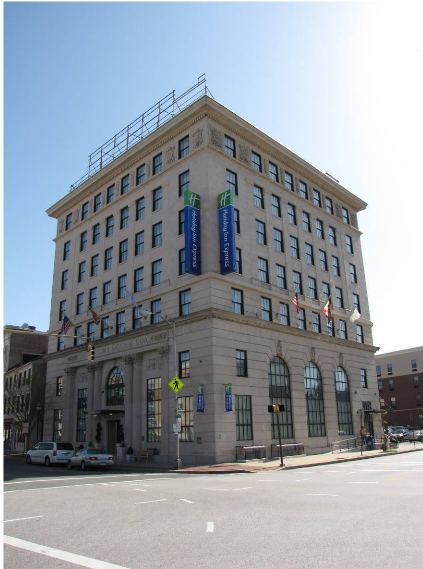
Old Town National Bank Building (also known as the Maryland National Bank, Old Town Branch)