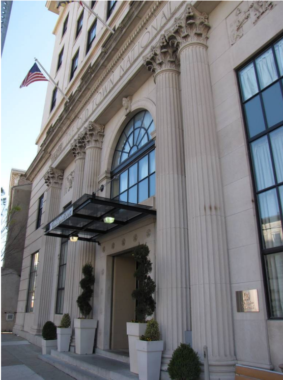
View of Gay St. façade.