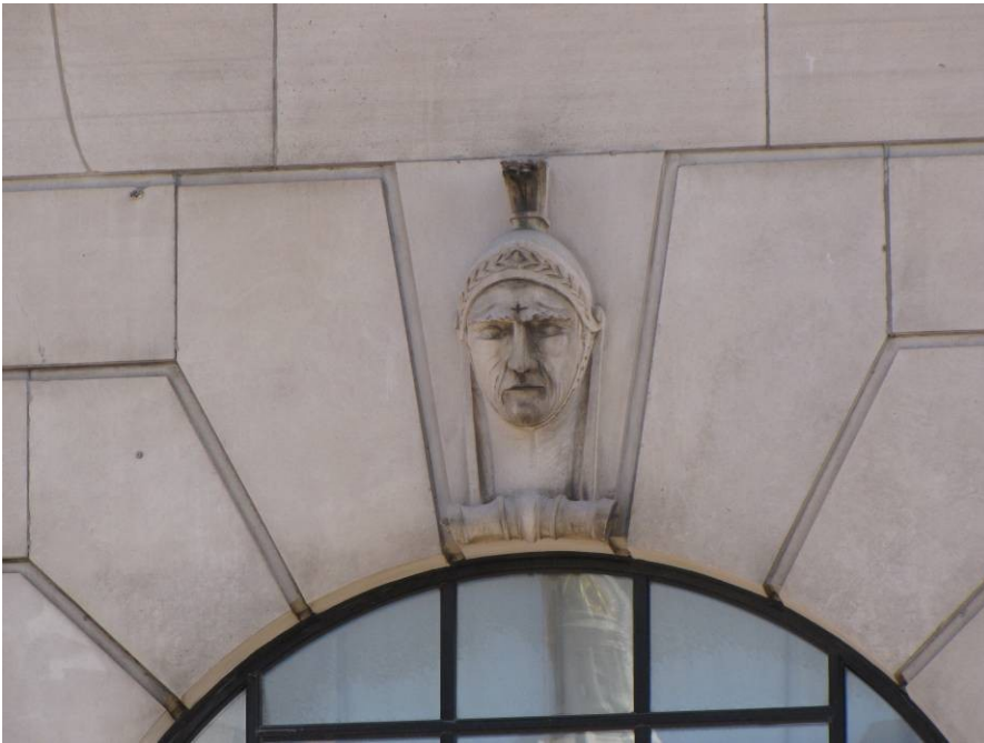
Detail of Greek warrior face on keystone, Fallsway façade.